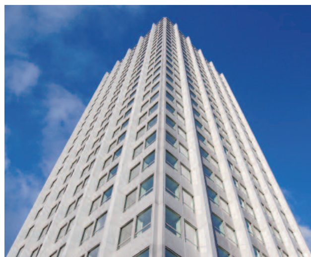
Climatisation of the Winterthur Wintower building with the HUBER ThermWin® system