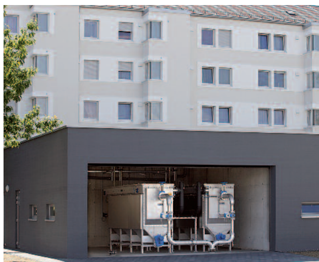
Heat station Straubing